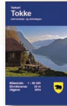
Map: Tokke 1 : 50 000

You are responsible for your own safety during the walk. Treat the countryside and grazing animals with respect. Take only photos, leave only footprints. Please take your rubbish home with you. Enjoy the trip!